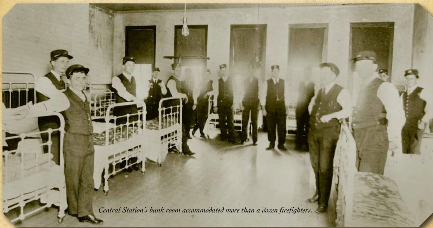
Central Station's bunk room accommodated more than a dozen firefighters.