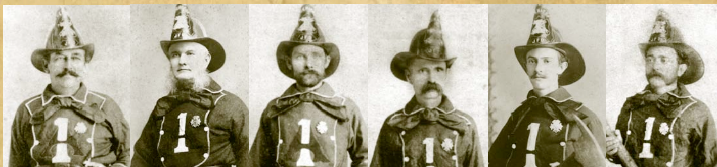
The helmets these volunteers are wearing identify them as members of the Americus Hook and Ladder Company. Turnout gear was more decorative than protective in the 1870s.

with traveling some of the troublesome roads and primitive paths en route to fires. Other fire apparatus often got stuck in sand and mud.