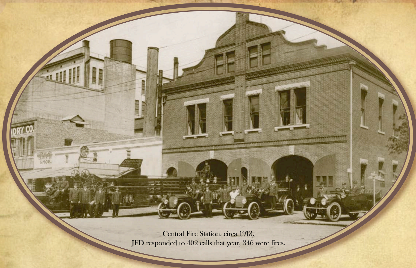
Central Fire Station, circa 1913. JFD responded to 402 calls that year, 346 were fires.