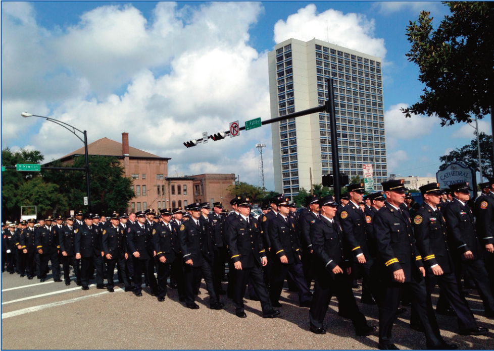
Eastbound on Ashley Street.