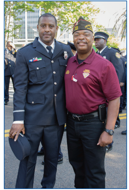
Staging on South Hogan Street.