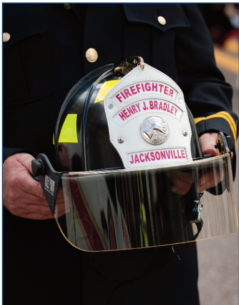
Staging on South Hogan Street.