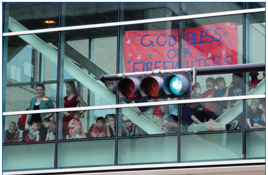
First Baptist Church's Academy salutes JFRD on Laura Street.