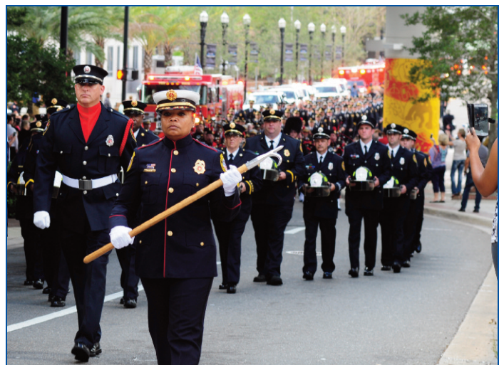
Marching north on Hogan Street.