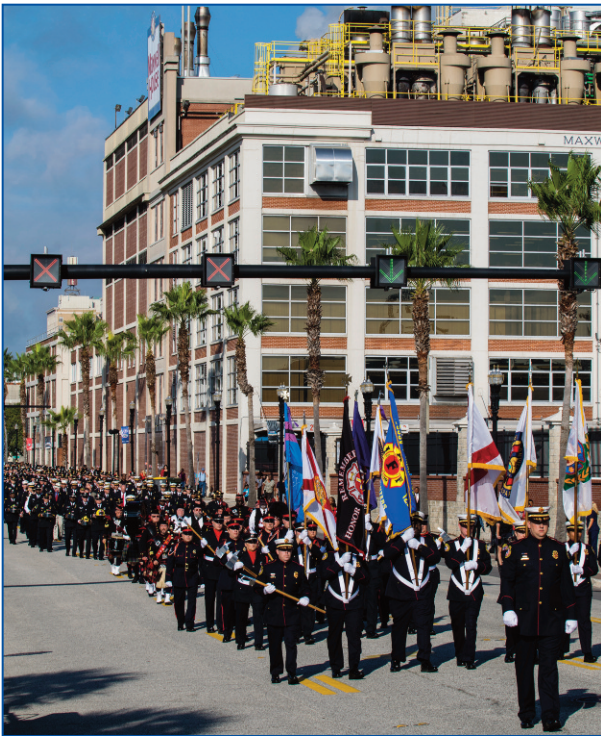
Above and below: Eastbound on Bay Street, passing Maxwell House.