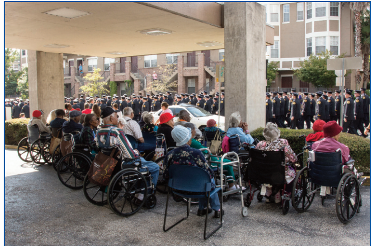
Above: Cathedral Care on East Ashley Street. Below: Ashley and Laura streets.