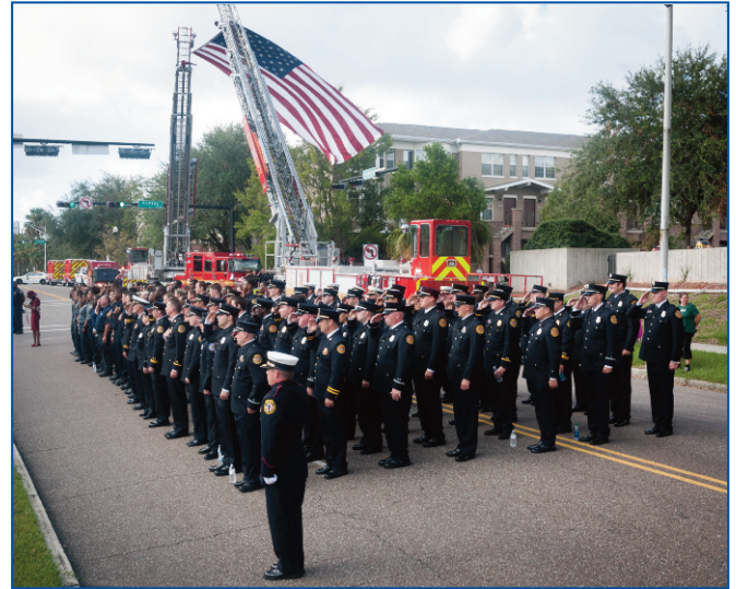
Above and upper right: Fallen Firefighter Memorial Service at Fire Station 1.