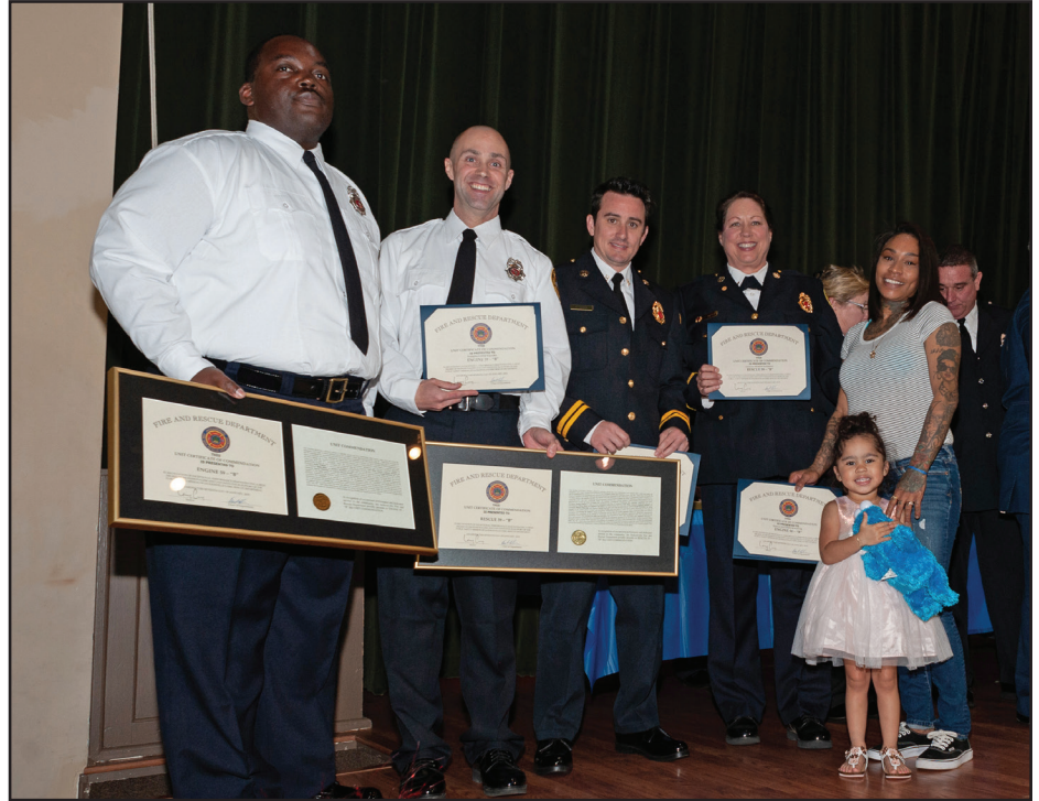
Members of Station 59 and Engine 58 saved a pediatric patient from drowning.